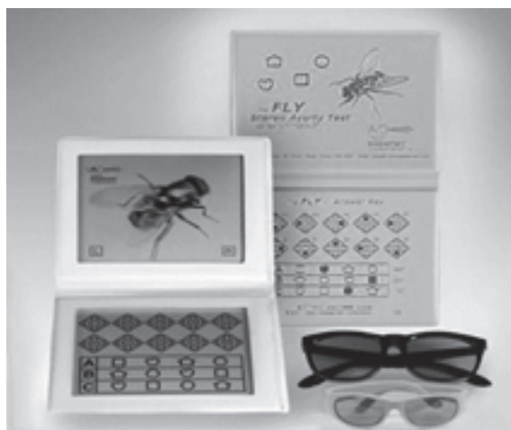
Obrázek 1./ Figure 1.

amount of time to resolve the test tasks. The average time of one test was about two minutes. The probands could tilt, zoom in, or zoom out the “fly” in any direction. In our research, we used the test with diamonds. One point was given for each correctly detected circle in the diamond. It was possible to achieve 10 points as a maximum. (Vision Assessment Corporation, 2012). The achieved number of points was recorded in a simple table.